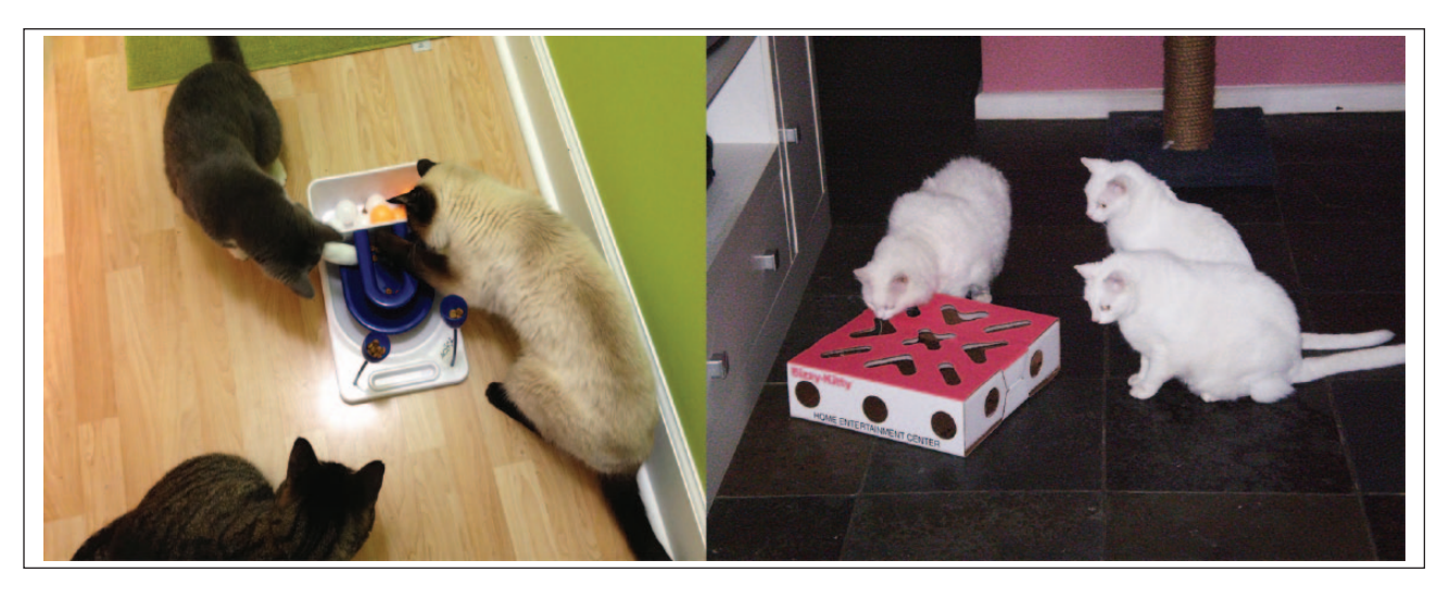
Figure 3 Some cats will use food puzzles together.