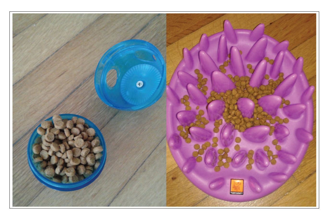
Figue 2 Puzzles should initially be filled as much as possible.