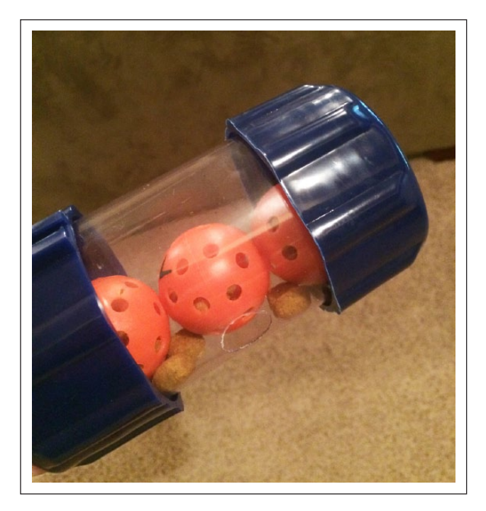
Figure 4 Placing a small puzzle inside a larger puzzle increases challenge for cats.