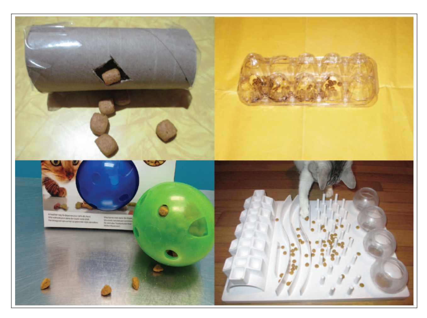
Figure 1 Clockwise from upper-left hand corner: homemade mobile, homemade stationary, purchased stationary and purchased mobile food puzzles.

Zoos and sanctuaries encounter many obstacles to providing adequate housing for felid species, which may have difficulty adjusting to captivity for several reasons. Territory and hunting opportunities are restricted, and many solitary species are housed in pairs or in groups. <sup>18</sup> The parallels with domestic cat housing are numerous.